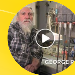
YFN Arts Artist Spotlight series on social media