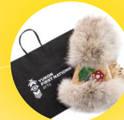
YFN Arts Brand Program