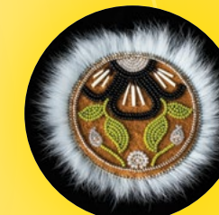
Bead, Hide & Fur Symposium