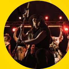
Co-presentations with partners such as Kwanlin Dün Cultural Centre, Yukon Arts Centre, Yukon Film Society, Gwaandak Theatre and Music Yukon