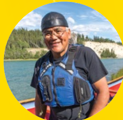
Cross-border artistic collaborations and exchanges