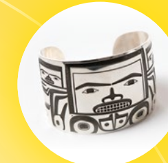
Yük'e Arts Market (Christmas)