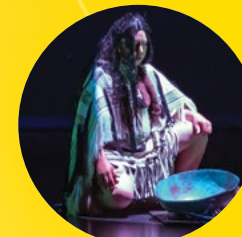
Dreaming Roots — YFN performing arts development project